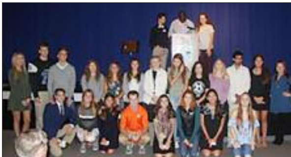
Lake Norman High School Junior Civitan Club charter members.

Hope everyone has a happy and safe Holiday Season!