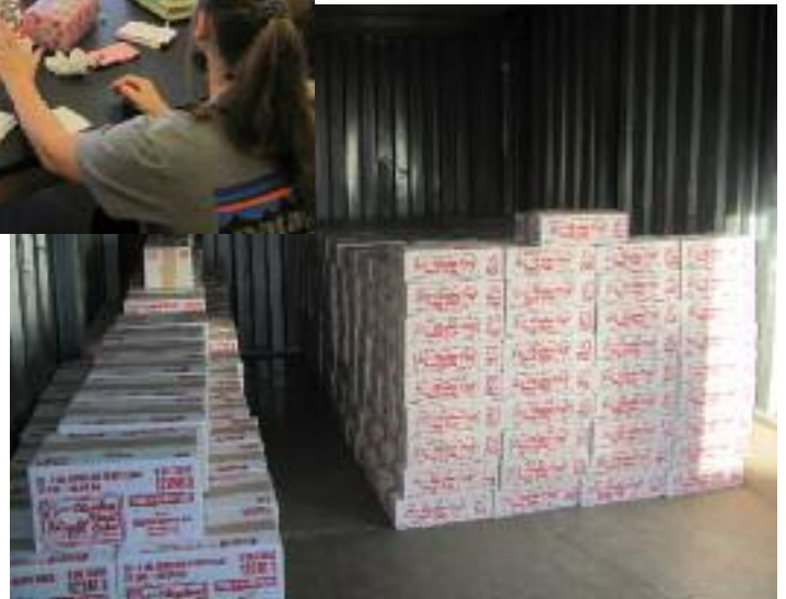
Right: Rhododendron fruitcake ready for distribution