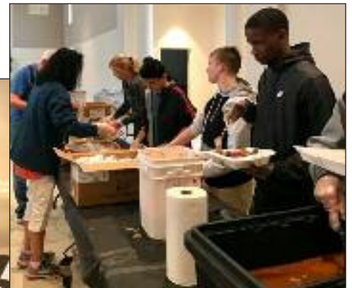
Members of the Mooresville High School EC Class filling the plates