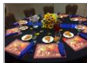
Table decor at District Meeting