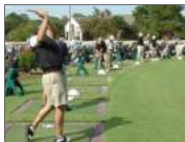
Golfers practice before the Civitan Golf Classic.