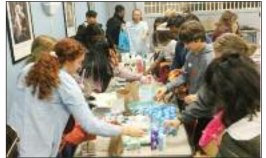
Junior Civitan District Project - purses and children's bags for Women's Shelters at November 18 District Meeting.

Sno - Do is coming up soon. If your club would like to make a donation, that would be great! Donation deadline is December 20. Thanks so much to the individu-