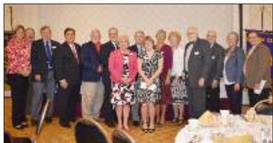
New board members and Cabinet sworn in at induction ceremony.

As one of the largest and most active Civitan clubs in the world, the Civitan Club of Salisbury wasted no