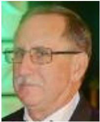
Woody Weddington NCDW Governor