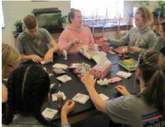
Above: Junior Civitans construct 200 Veterans' Cards.