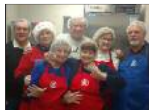
Salisbury Club members serving at Thomas the Tank Engine fundraiser