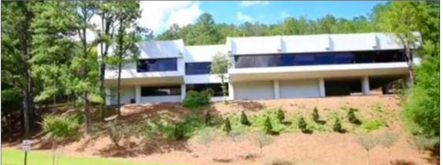
Newly renovated International Headquarters of Civitan International, Birmingham, AL

For those of you lucky enough to attend the 2017 International 100th Anniversary Civitan Convention, you had a chance to tour the newly renovated International headquarters. It is located in Birmingham, Alabama, the birthplace of Civitan. Operations