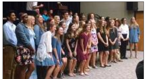
Charter members - Concord High School Junior Civitan Club