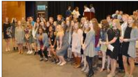
Oak Grove High School Junior Civitan Charter Members.

District Dance a Thon to be held at North Davidson High School. Date is February 3 and weather date is February 10 from 12:00 pm to 4:00 pm. Admission will be 10.00 each.