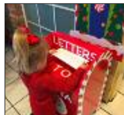
A letter to Santa

nor Woody to have a successful event; so they prepared breakfast delights, fashioned centerpieces and any other tasks needed to get the event site ready for the day!