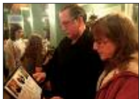
Governor Woody and Helen read museum tree dedication.