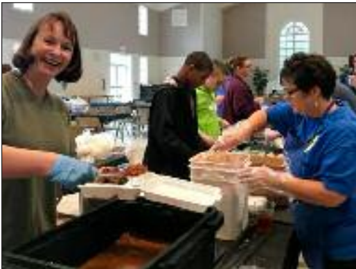
Members from both Mooresville and Lake Norman Clubs working together to make plates.

in, dine in or Civitan delivers the plates right to the door of those who order 10 or more plates. Proceeds from this great event are divided among great local charities such as the HealthReach Community Clinic, Lake Norman Special Olympics, Victory Junction and several other worthy organizations.